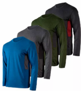
Real Essentials Matching Workout Clothing Set

Going to the gym can be a harrowing test of your self-confidence. You could be the fittest person in the place, but still feel like you're not good enough. There are many ways to help with this, but the simplest is to go to your gym wearing clothes that you feel like you look good in and also that you're comfortable in. An easy way to make yourself look good in gym clothes is to buy matching workout clothing sets that do all the mixing and matching for you.