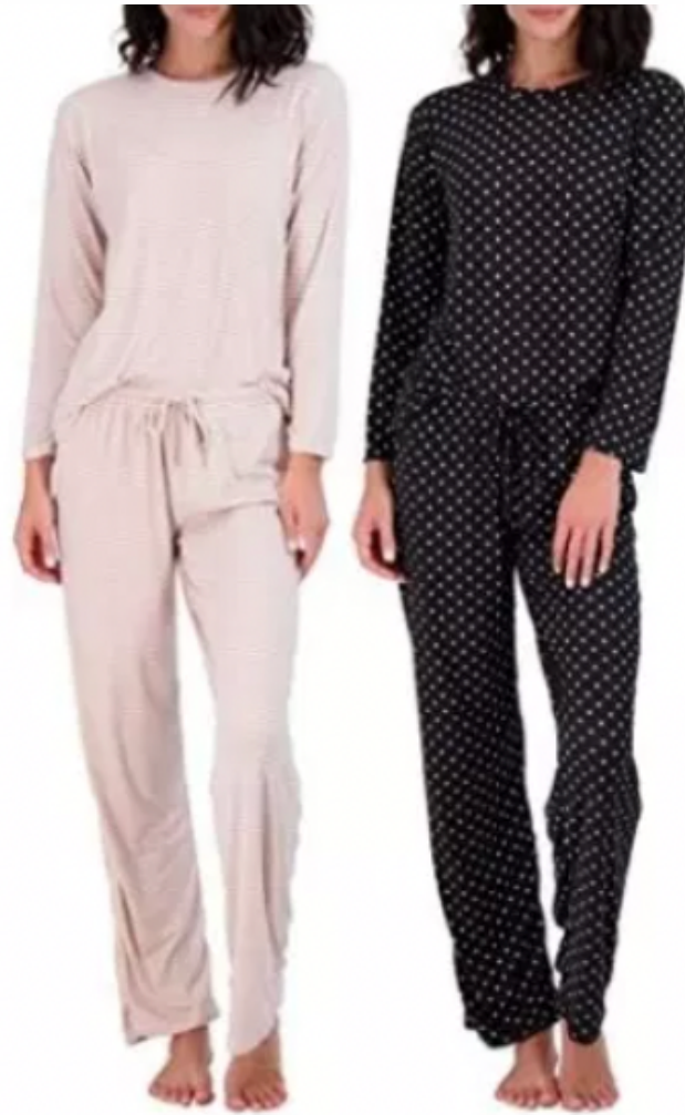
Real Essentials Two-pack Women's Pajama Set

With two sets of pajamas in a pack, this is a perfect choice for couples to wear together. The shirt has long sleeves, and the pants are long as well. They make for a cozy Valentine's Day outfit if you're working from home or want to stay comfy all day long.